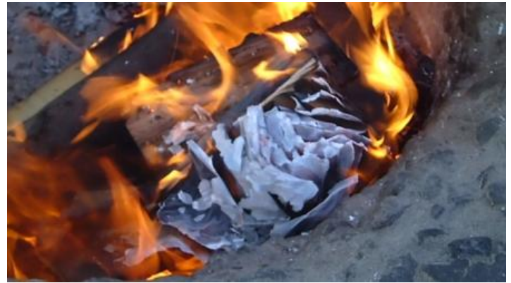
Great Expectations, after...