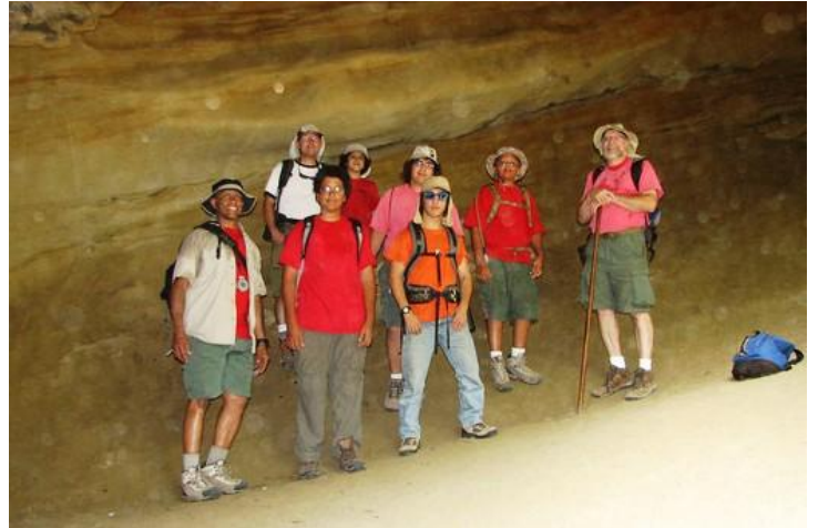
Very cool in this cave, which is a big plus on a hot morning hike.