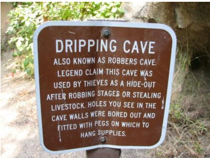
Some History on a stick