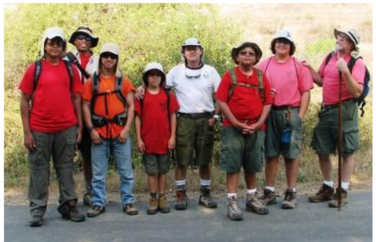
T314 crew ready to go. ...and the guys with signature pink shirts.

I looked for geocaches around there, but it seems they are discouraged by the park rangers. But Dripping Cave itself IS a geocache -- of the "virtual cache" type.