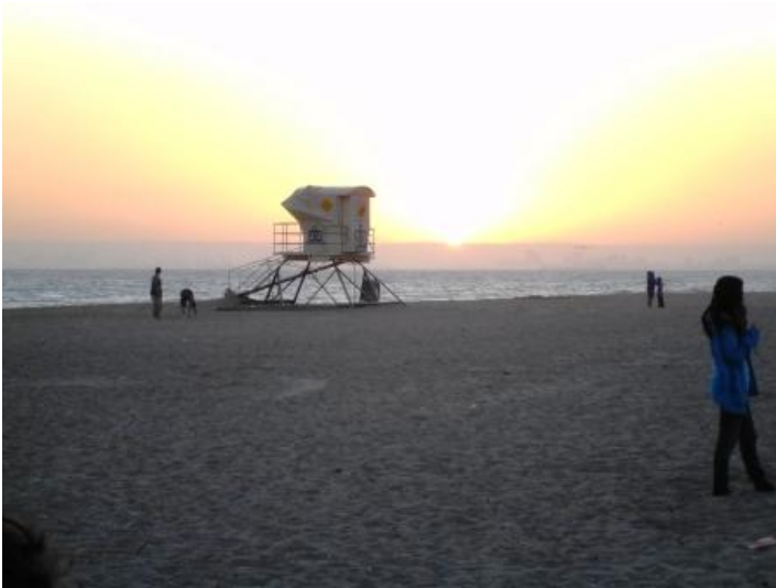
Sunset at Twr 20.