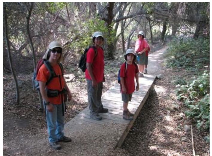
Scouts looking at nice garden of Poison Oak.