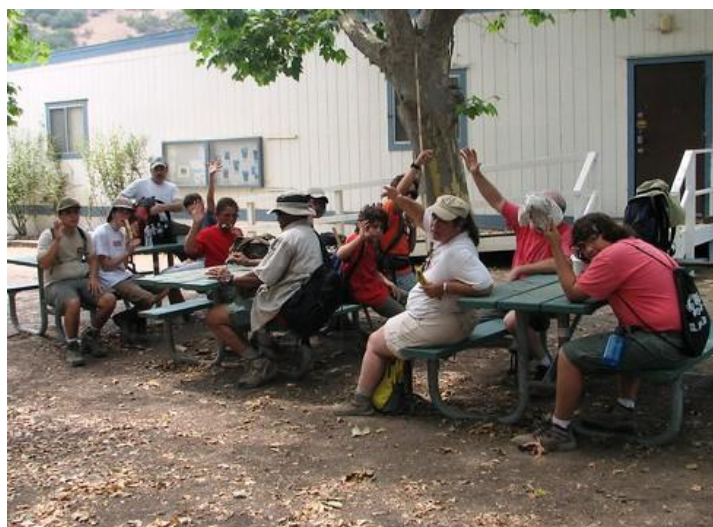
Decompressing after hike – Yup, all present and still responsive to voice – good sign.

July 14th thru July 20th - Summer camp at Camp Whitsitt. All scouts attending the camp must meet at the Post at 8:00 a.m. Sunday 14th, the day of the trip, and leave by 8:30 AM so no late arrivals. The driving time will be around 4 hours 15 minutes, not including