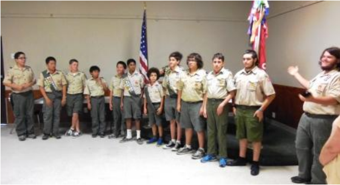
Popcorn patch awarded.