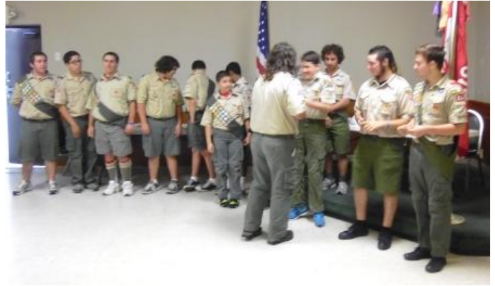
And even more awards...