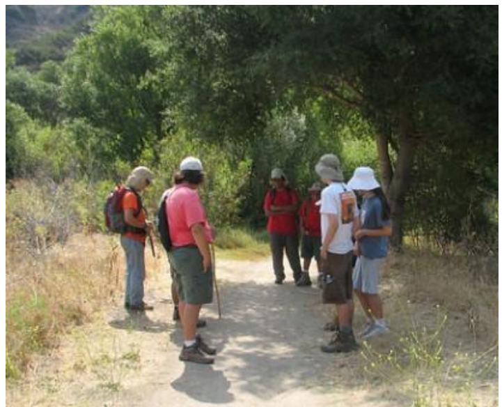
...and then looking at another poisonous organism.