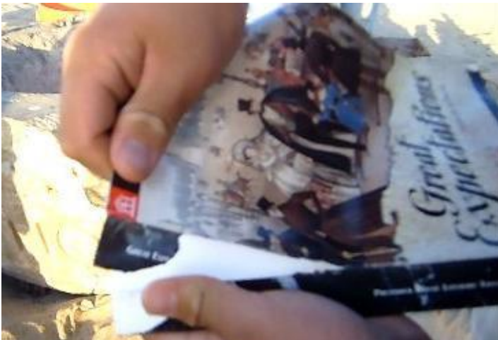
"Great Expectations" before...