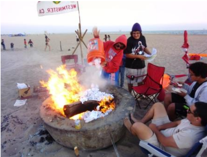
Cannot wait for dark to begin burn!