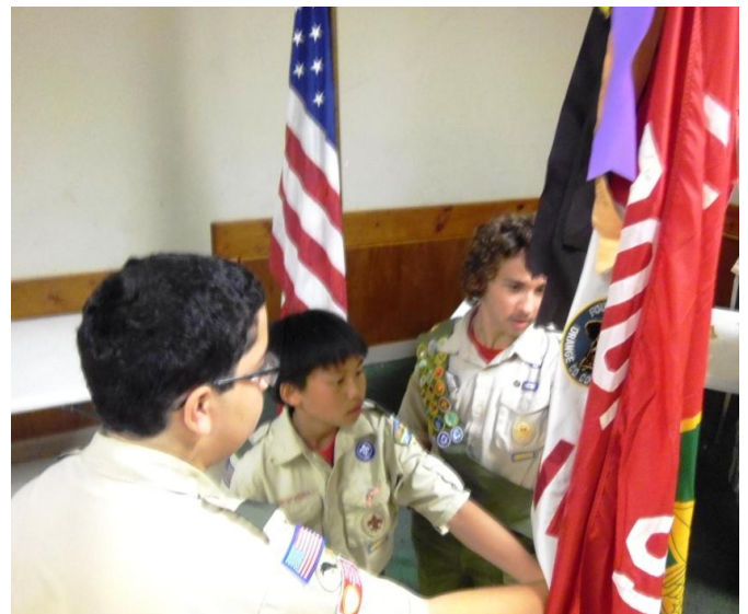
Troop 314 gets new Patrol leaders sworn in.