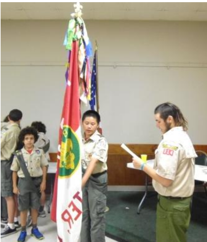
....ad more new officers take the oath – sorry only got a few pics that were not blurry.